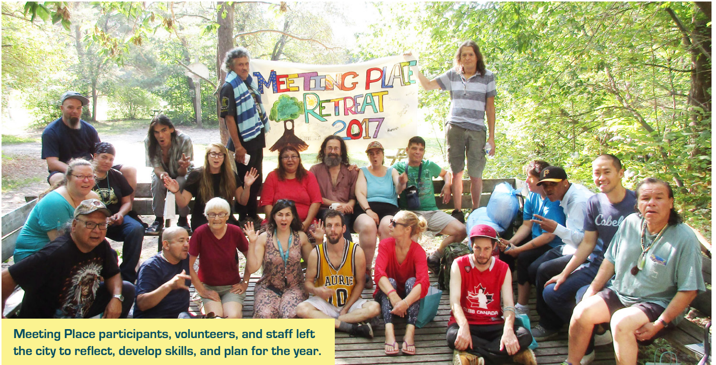
Meeting Place participants, volunteers, and staff left the city to reflect, develop skills, and plan for the year.