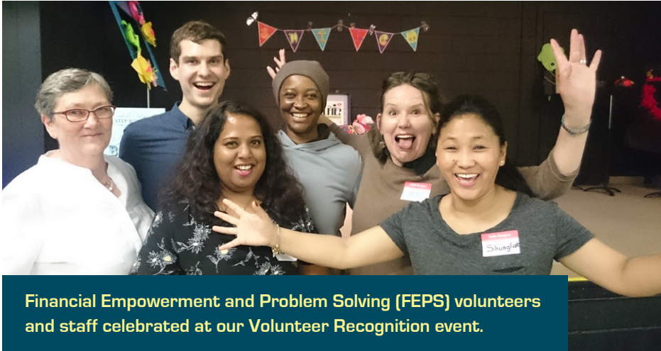
Financial Empowerment and Problem Solving (FEPS) volunteers and staff celebrated at our Volunteer Recognition event.

credit union, IC Savings, helped arriving families set up their first Canadian bank accounts and arranged a weekend job for a father so he could take English classes during the week. Host families and community sponsors found housing for new families, collected boots and winter clothing, and learned more about how to enrol children in schools.