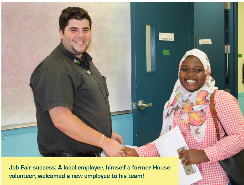
Job Fair success: A local employer, himself a former House volunteer, welcomed a new employee to his team!