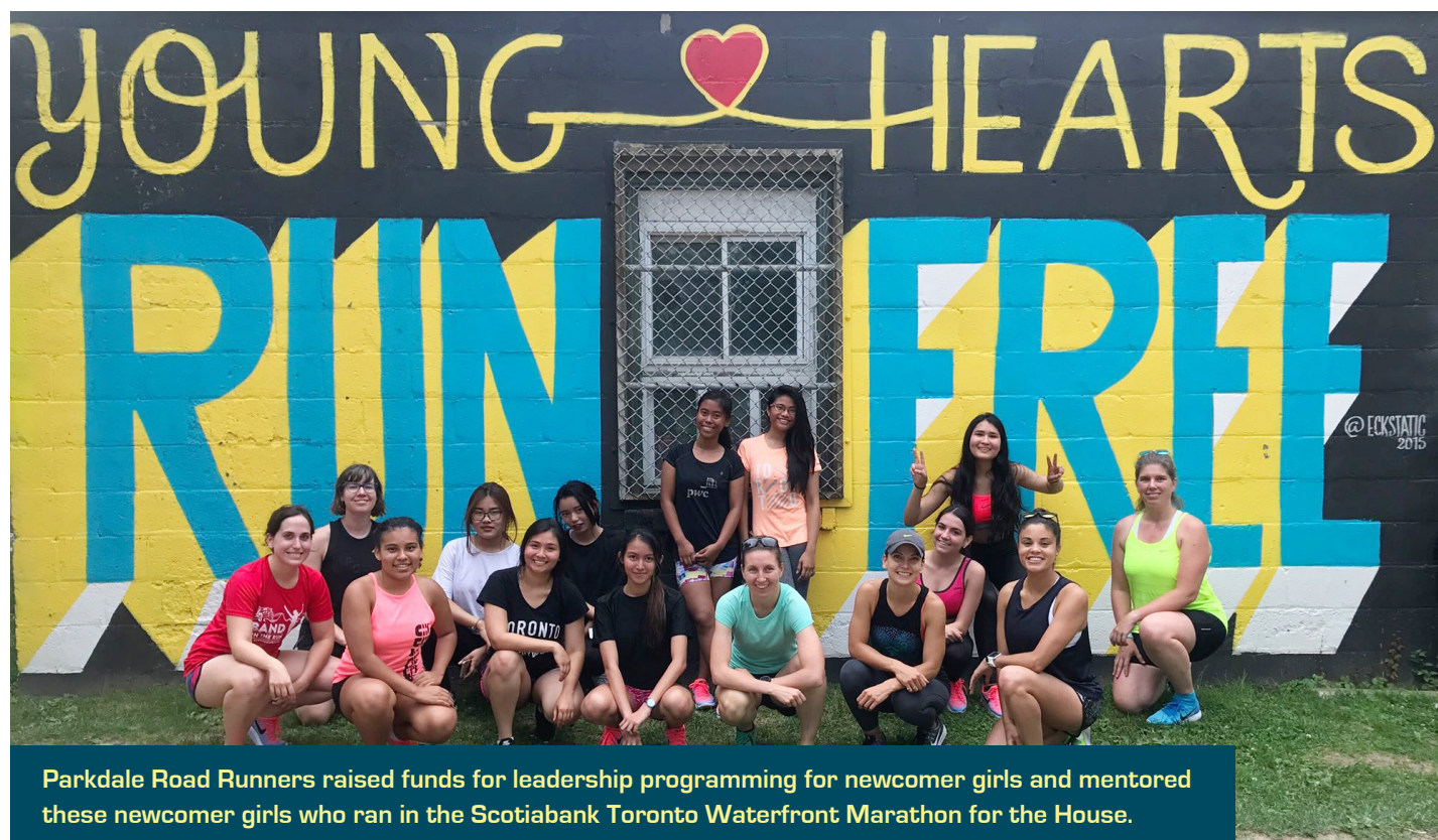
Parkdale Road Runners raised funds for leadership programming for newcomer girls and mentored these newcomer girls who ran in the Scotiabank Toronto Waterfront Marathon for the House.

St. Christopher House Community Endowment