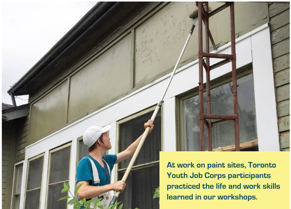
At work on paint sites, Toronto Youth Job Corps participants practiced the life and work skills learned in our workshops.