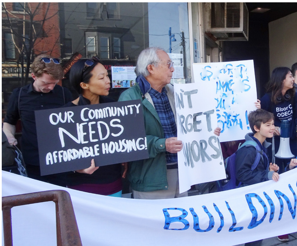
Neighbours working together for community benefits in new developments.