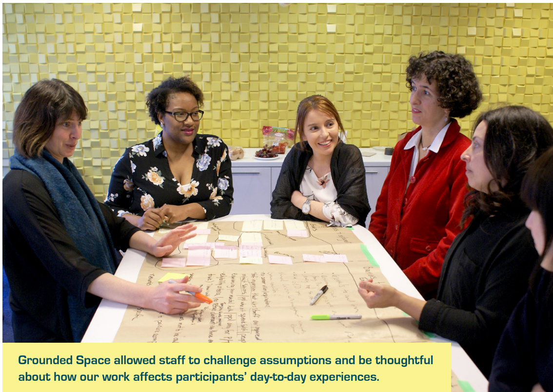
Grounded Space allowed staff to challenge assumptions and be thoughtful about how our work affects participants' day-to-day experiences.