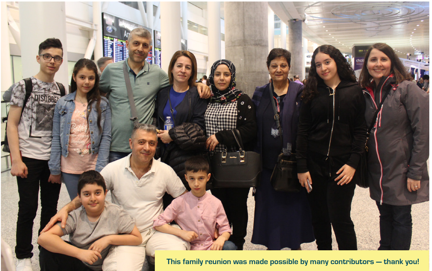
This family reunion was made possible by many contributors — thank you!

Sponsors and our supporting staff team from Immigrant and Refugee Services also realized settling in Toronto requires more than just money. Community members volunteered to find furniture for arriving families. Our local