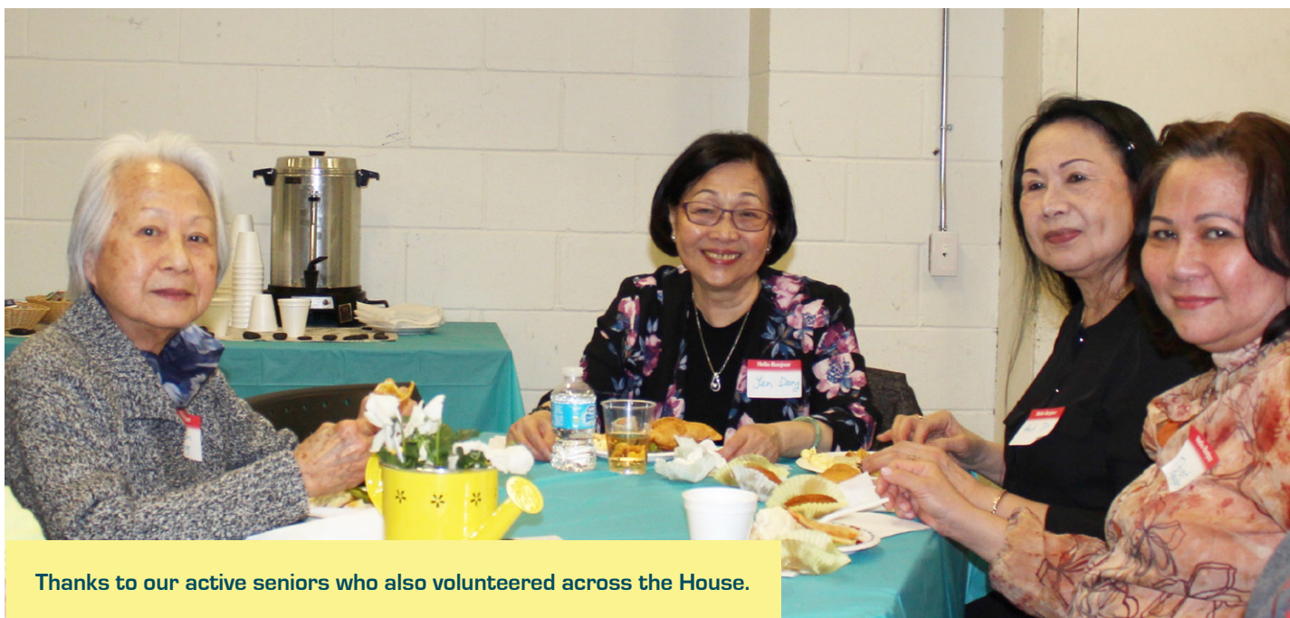
Thanks to our active seniors who also volunteered across the House.