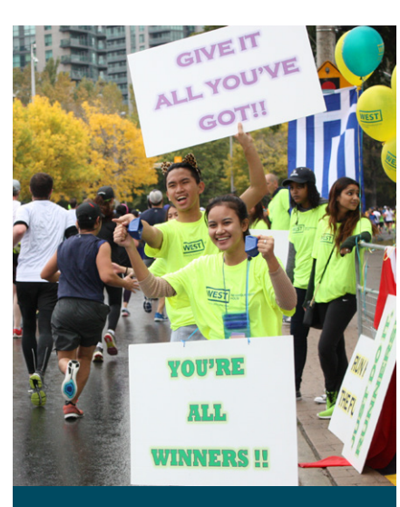
Our supporters were out in full force on the sidelines too.